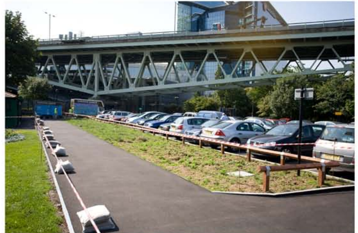
Gravel laid out at intervals to enable the path to be completed in one.