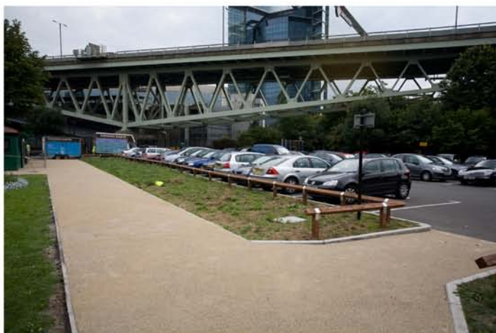
The completed pathway.