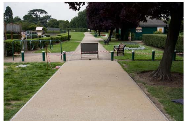
The new pathway connecting to the existing pathway.