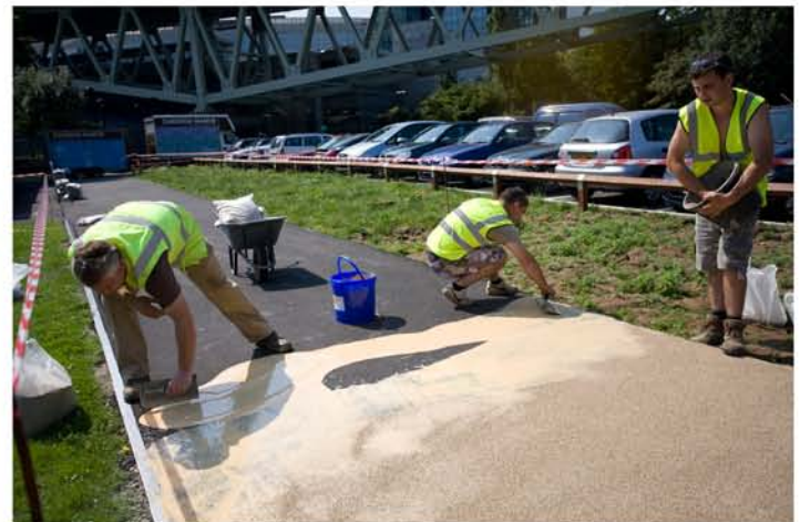
Resin is spread over the sub-base with and the gravel is scattered on top.