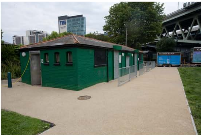
The area around the changing rooms was masked off and surfaced once the main pathway was cured.