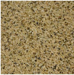
0.5-1.4mm Chinese Bauxite