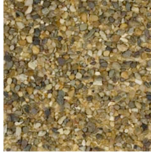
1-3mm Rounded Sepia (Unsealed)

All samples are sealed unless otherwise stated