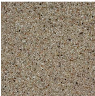
0.9-1.4mm Multi Flint

All samples are sealed unless otherwise stated