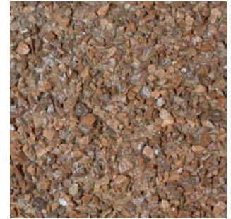
1-3mm Red Granite