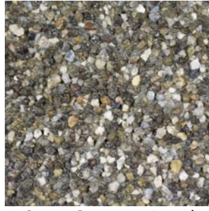
1-3mm Guyanan Bauxite