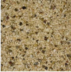
1-3mm Chinese Bauxite