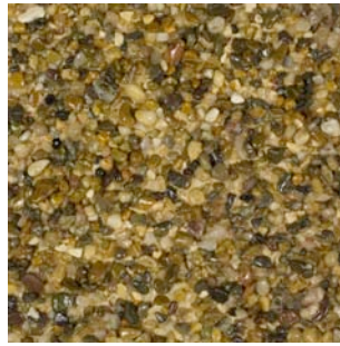
1-3mm Rounded Sepia