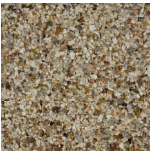
1-3mm Multi Flint